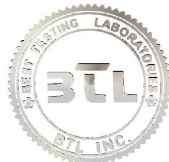
Ethan Ma Authorized Signatory

The test data, data evaluation, and equipment configuration contained in our test report(s) above was(were) obtained utilizing the test procedures, test instruments, test sites that has been accredited according to the ISO/IEC 17025 quality assessment standard and technical standard(s). The test data contained in the referenced test report relate only to the EUT sample and item(s) tested.