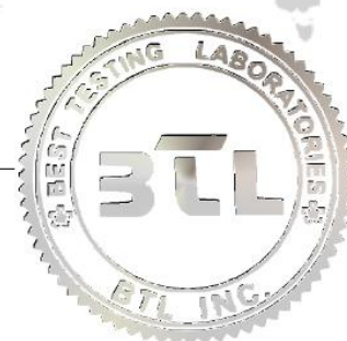
Ethan Authorized Signatory

The test data, data evaluation, and equipment configuration contained in our test report(s) above was(were) obtained utilizing the test procedures, test instruments, test sites that has been accredited by the Authority of A2LA according to the ISO/IEC 17025 quality assessment standard and technical standard(s). The test data contained in the referenced test report relate only to the EUT sample and item(s) tested.